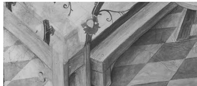
Fig. 4. Under infrared light, a cat scampering out from the deathbed of Constantine, the Great becomes visible (see left) along with the emperor's chamber pot and slippers (see right), all of which are missing from the painting layer.

Several compositional changes have also been made during the painting process and an entire series of initially planned details have been left out. As has been observed in earlier writings, 18 on a picture in the bottom row of the retable in the second position, a cat can be seen scampering out from under the deathbed of Constantine, the Great apparently with a mouse or rat in his mouth through the very thin layer of paint. The emperor's chamber pot and characteristically sharp-toed slippers are also hidden under the bed (Fig. 4).