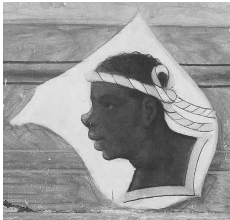
Fig. 6. The Negroid profile on the Black Heads' coat of arms was initially painted with facial features more typical of the white race.

coat of arms on one panel and the Confraternity of Black Heads' on the other – have both been adjusted a bit in the course of the painting. It is curious that the Negroid profile on the Black Heads' coat of arms was not given the features characteristic of its race until the painting stage. Initially, the profile seems to have been of a white man with a straight nose and narrow lips (Fig. 6).