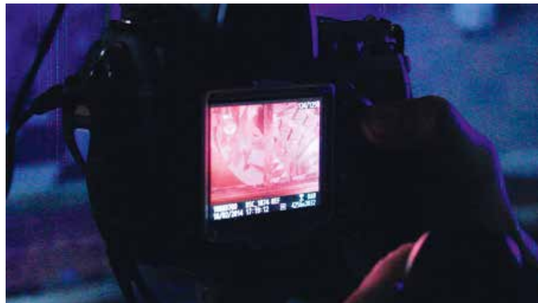
Fig. 1. Infrared analyses executed using a multispectral camera, which reveals the artist's underdrawing.

when analyses were conducted of the only retable that carries Hermen Rode's signature – the so-called altarpiece of St. Luke in Lübeck. 3