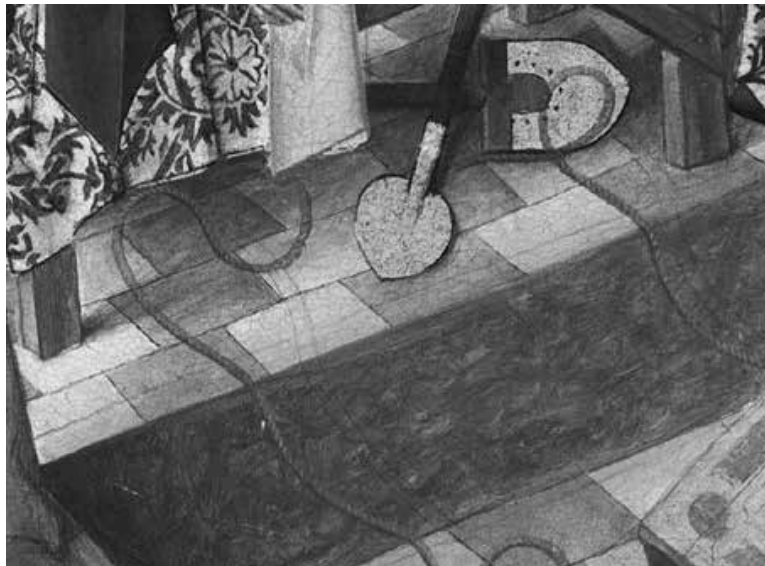
Fig. 7. A, B and C. From the scene of St. Luke's entombment on the pentimenti of the St. Luke's retable: on the underdrawing, the ropes for lowering the coffin extend under the gravestone, as if the initial composition had been altered by adding the gravestone.