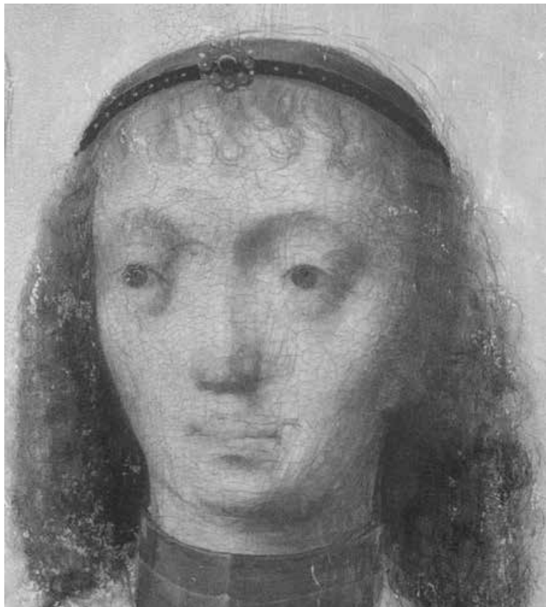
Fig. 3. The face of St. Victor in the closed position of the retable – the shift between the underdrawing and the final composition is visible on the infrared photo.

surface. 17 It is quite natural to assume that in order to produce such a huge commission that needed to be completed rapidly, Rode needed a larger than usual team of assistants and well-thought solutions to realise his vision. However, no clear signs have been found that would indicate the specific method used to transfer the preparatory drawing.