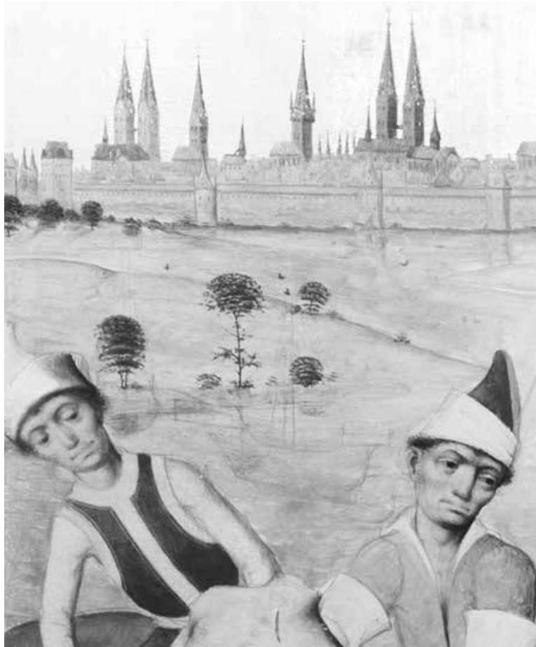
Fig. 5. A and B. The three ships that were originally planned for the river that flows out of the city (photo a) have not been painted for some reason (photo b). Photo: Hembo Pagi, Andres Uueni (Archaeovision R&D).

On the lower right painting area of the retable in the open position, which depicts the scene of St. Victor's body being cast in the water against a panorama of Lübeck, three boats were initially depicted on the Wakenitz River that flows out of the city: a large high-masted ship moving in the direction of the viewer, a proud Hanseatic cog in profile and a small simple boat in front of it (Fig. 5 a and b).