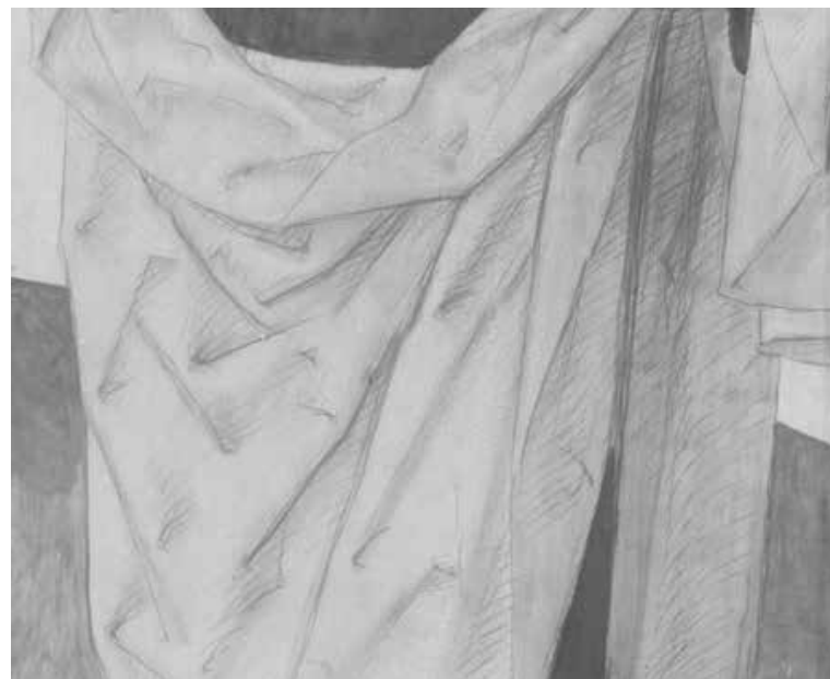
Fig. 2. The shaded areas with the dense hatching of the drapery fabric and hooked-shaped fabric folds.

gained popularity in the second half of the 15 th century 16 , Rode seems to have remained true to tradition.