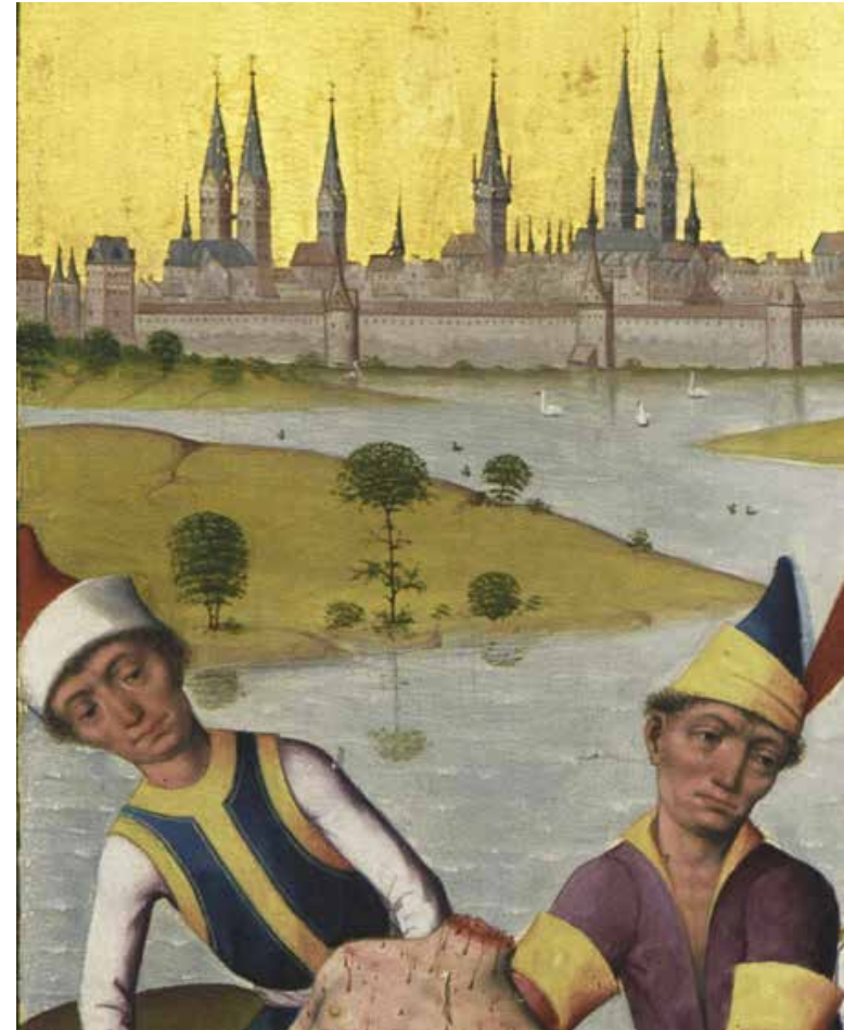
Fig. 5. A and B. The three ships that were originally planned for the river that flows out of the city (photo a) have not been painted for some reason (photo b).

On the lower right painting area of the retable in the open position, which depicts the scene of St. Victor's body being cast in the water against a panorama of Lübeck, three boats were initially depicted on the Wakenitz River that flows out of the city: a large high-masted ship moving in the direction of the viewer, a proud Hanseatic cog in profile and a small simple boat in front of it (Fig. 5 a and b).